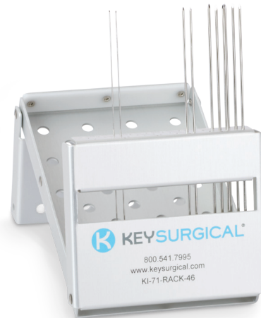
KI-71-RACK-46 6.25" x 4.125" x .75"