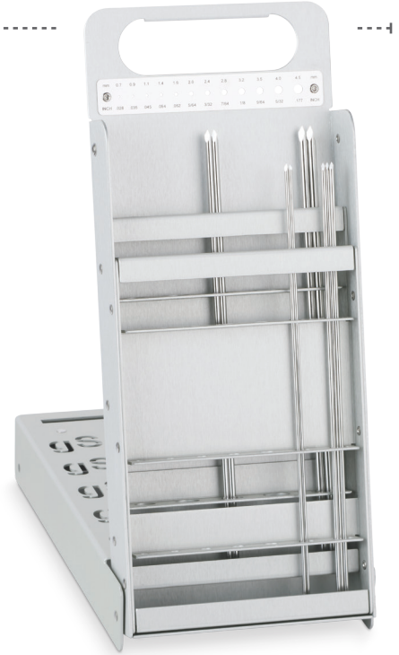
KI-71-RACK 12.5" x 5.25" x 1.5"