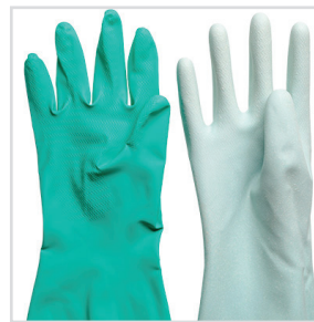
Lined for comfort