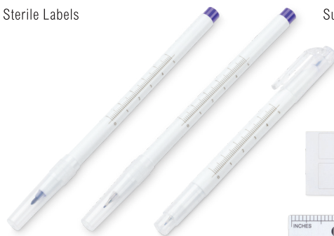
Surgical Skin Markers