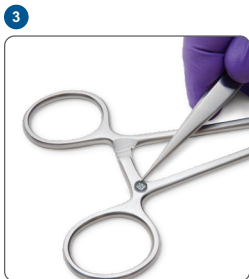
3 place KeyDot on instrument