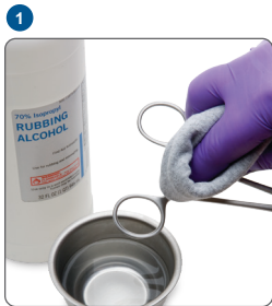
1 clean application area