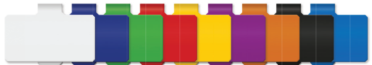
2.16" x 1.18"