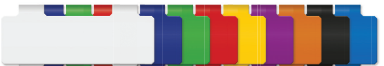
3.54" x 1.18"