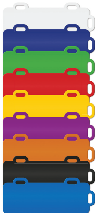
3.54" x 1.30"