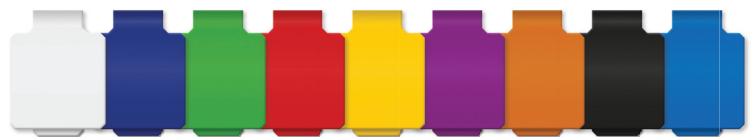
1.18" x 1.18"