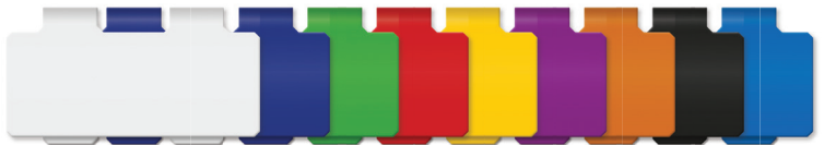
2.76" x 1.18"