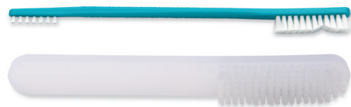
TOOTHBRUSH-STYLE CLEANING BRUSHES